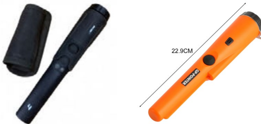
Exemplary Counterfeit Products Sold on Defendant Internet Stores Infringing on Plaintiff's Registered Patents 4

57. Defendants' activities constitute willful patent infringement under 35 U.S.C. § 271.