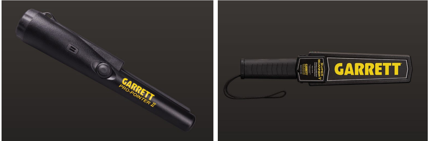
Exemplary Images of Plaintiff's Products (Garrett Pro-Pointer II and Garrett Super Sarcanner V Metal Detector)

17. Since at least 1979, the GARRETT ELECTRONICS Trademarks are and have been the subject of substantial and continuous marketing and promotion by Plaintiff. Plaintiff has and continues to widely market and promote the GARRETT ELECTRONICS Trademarks in the industry and to consumers. Plaintiff's promotional efforts include—by way of example but not limitation—through substantial marketing and advertising on the Internet, television, radio, and trade shows.