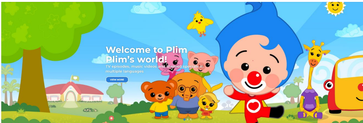
Images sourced from Plaintiff's Official PLIM PLIM Website ( https://plimplim.tv/en/ )

9. KIDS MAGIC LLC first published an animated series featuring the character of PLIM PLIM on September 21, 2011, which aired on the Disney Junior (Latin America) channel “Las flores de Mei-li”. The audiovisual was titled “El Payaso Plim Plim, Un Héroe del Corazón”. The series utilizes engaging visual and musical content to encourage active learning, promote physical movement, foster social-emotional development, and inspire creativity and curiosity in children.