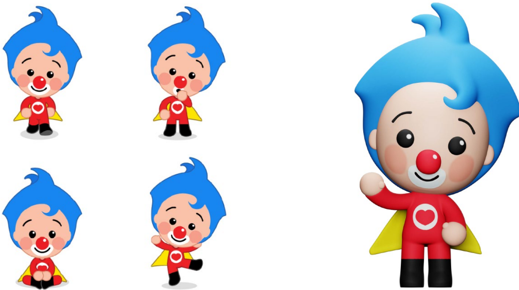
2-Dimensional and 3-Dimensional Copyrighted Images of Plaintiff's PLIM PLIM Character, Covered by the PLIM PLIM Copyrights