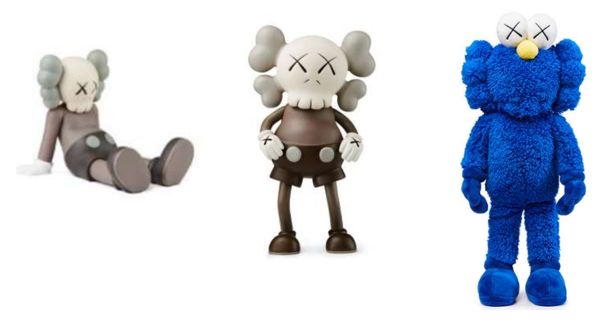
Compared to Exemplary Counterfeit Products Offered by Defendants