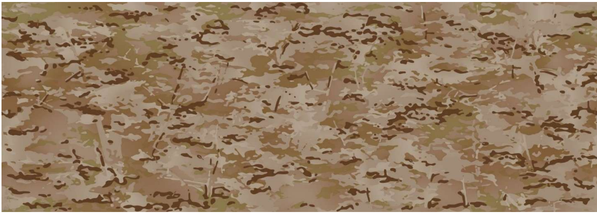
TROPIC (VA 1-902-832)