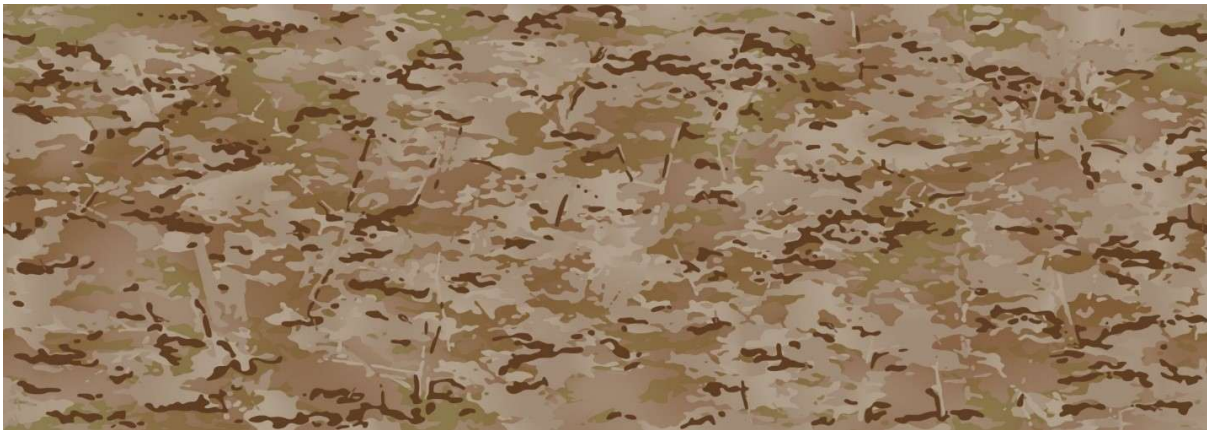
TROPIC (VA 1-902-832)