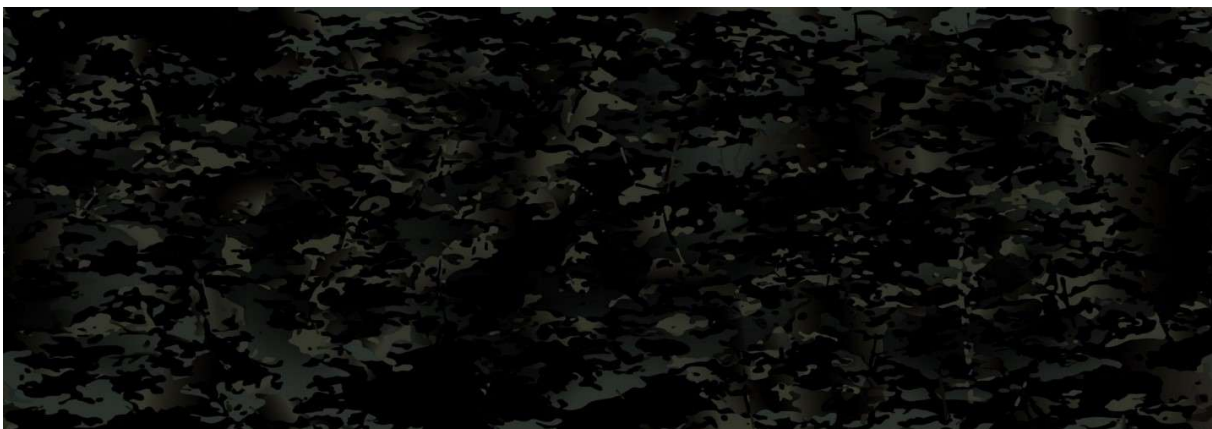
ARID (VA 1-902-827)