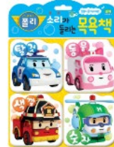
소리가 들리는 목욕책 ₩ 9,800 Toy Books

8. Plaintiff ROI VISUAL CO., LTD. is the owner of the following trademark and copyright registrations for ROBOCAR POLI: U.S. Trademark Registration Nos. 4,762,407; 4,910,663; and 4,743,917 (collectively, the “ROBOCAR POLI Trademarks”). True and correct copies of the federal trademark registrations are attached hereto as Exhibit 1. Plaintiff also owns Copyright Registration Nos. VA0001807317; VA0001811873; and VA0001815319. True and correct copies of the copyright registrations are attached hereto as Exhibit 2 (collectively, the “ROBOCAR POLI Copyrights”).