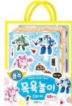
목욕놀이 스티커 - 도르 놀이 ₩ 16,000 Toy Books