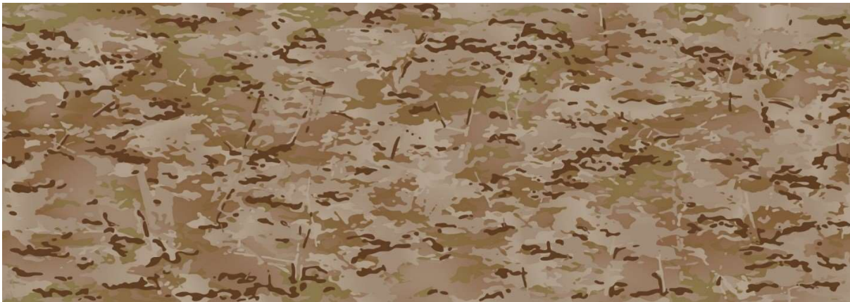
TROPIC (VA 1-902-832)