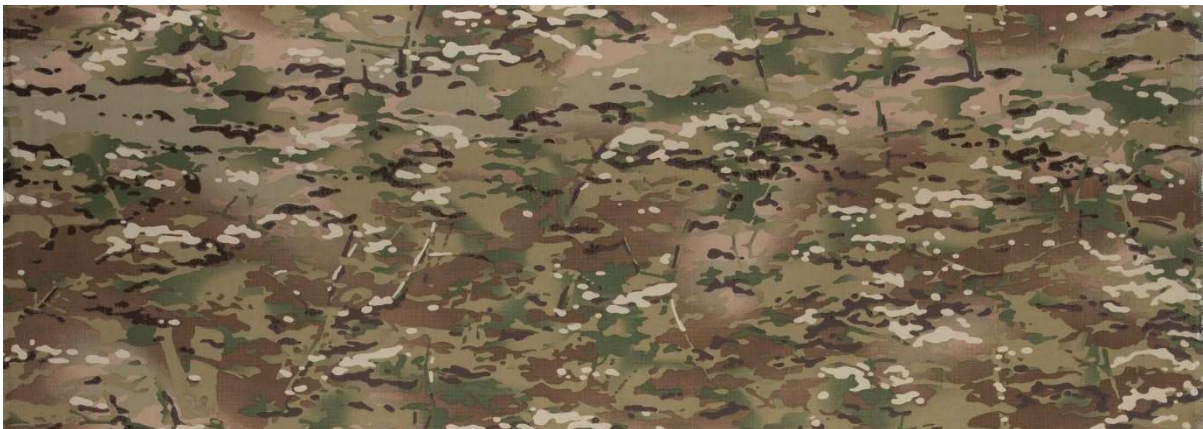
BLACK (VA 1-902-826)