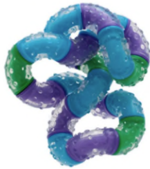
Tangle Therapy Sold Out