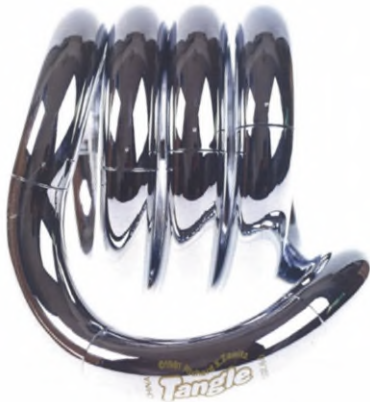
Exemplary Picture of Plaintiff's Copyright

62. Upon information and belief, Defendants have directly copied Plaintiff's copyrights for the TANGLE products. Alternatively, Defendants' representations of Plaintiff's copyrights for the TANGLE products in the Defendant Internet Stores are strikingly similar, or at the very least substantially similar, to Plaintiff's copyrights for the TANGLE products and constitute unauthorized copying, reproduction, distribution, creation of a derivative work, and/or public display of Plaintiff's copyrights for the TANGLE products. As just one example, Defendants deceive unknowing consumers by using the TANGLE copyrights without authorization within the product descriptions of their Defendant Online Store to attract customers as follows: