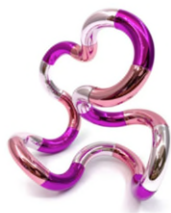
Palm Tangle Metallic $ 8.00