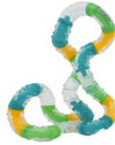
Tangle BrainTools Imagine Sold Out