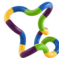
Tangle Jr. Classic $ 5.00