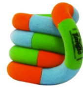
Tangle Jr. Fuzzies Sold Out