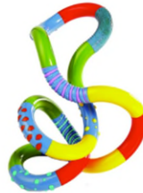
Tangle Original Textured Sold Out