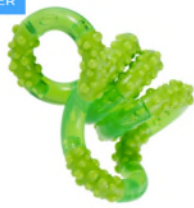
Tangle Jr. Crush Series $ 7.00