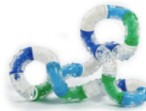
Tangle Relax Therapy $ 10.00