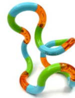
Palm Tangle Classic Sold Out

17. Since at least 1993, the TANGLE Trademark is and has been the subject of substantial and continuous marketing and promotion by Plaintiff. Plaintiff has and continues to widely market and promote the TANGLE Trademark in the industry and to consumers. Plaintiff's promotional efforts include — by way of example but not limitation — substantial print media, the TANGLE Products' website and social media sites, and point of sale materials.