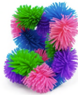
Tangle Hairy Sold Out