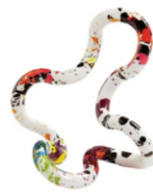
Tangle Jr. Masterpiece $ 8.00