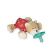
PJ BABY BEAR