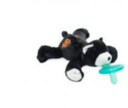
WUBBANUB NEW YORK YANKEES™ PINSTRIPE PUPPY